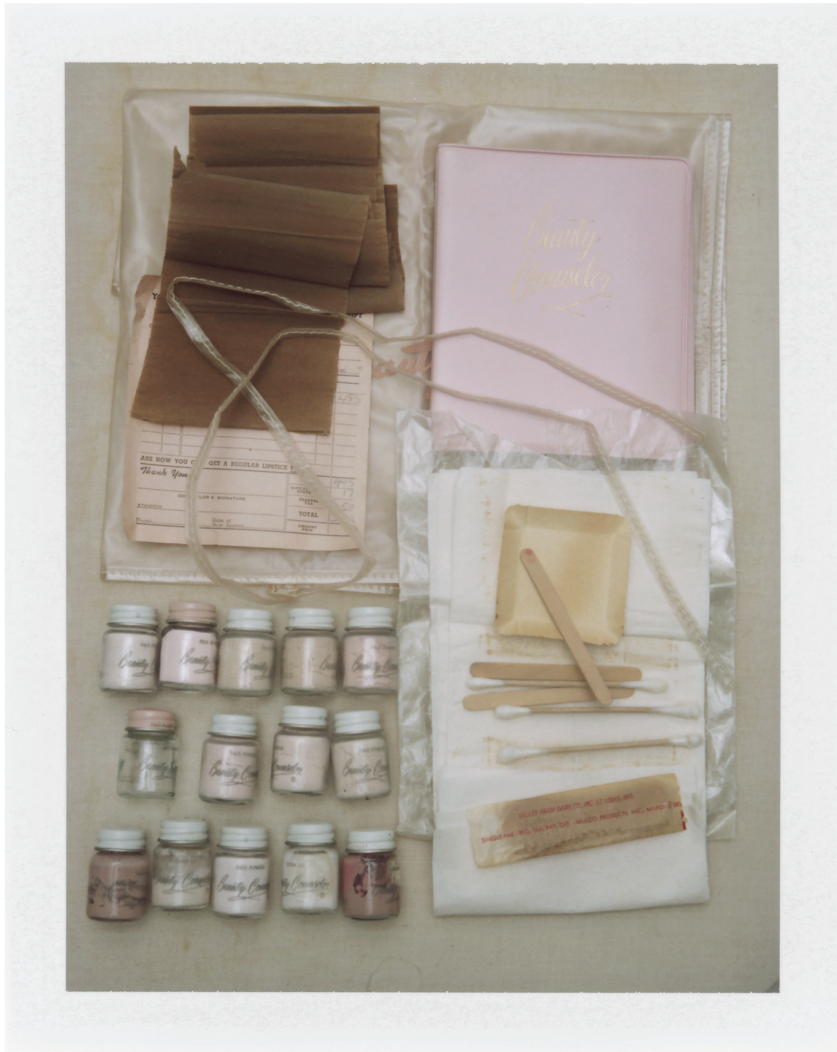
DARLENE (4) ORIGINAL POLAROID 2015.