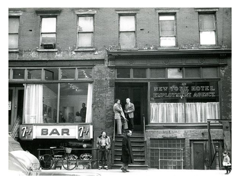
Fred W. McDarrah: Willem de Kooning on 10th Street stoops with novelist Noel Clad, April 5 1959