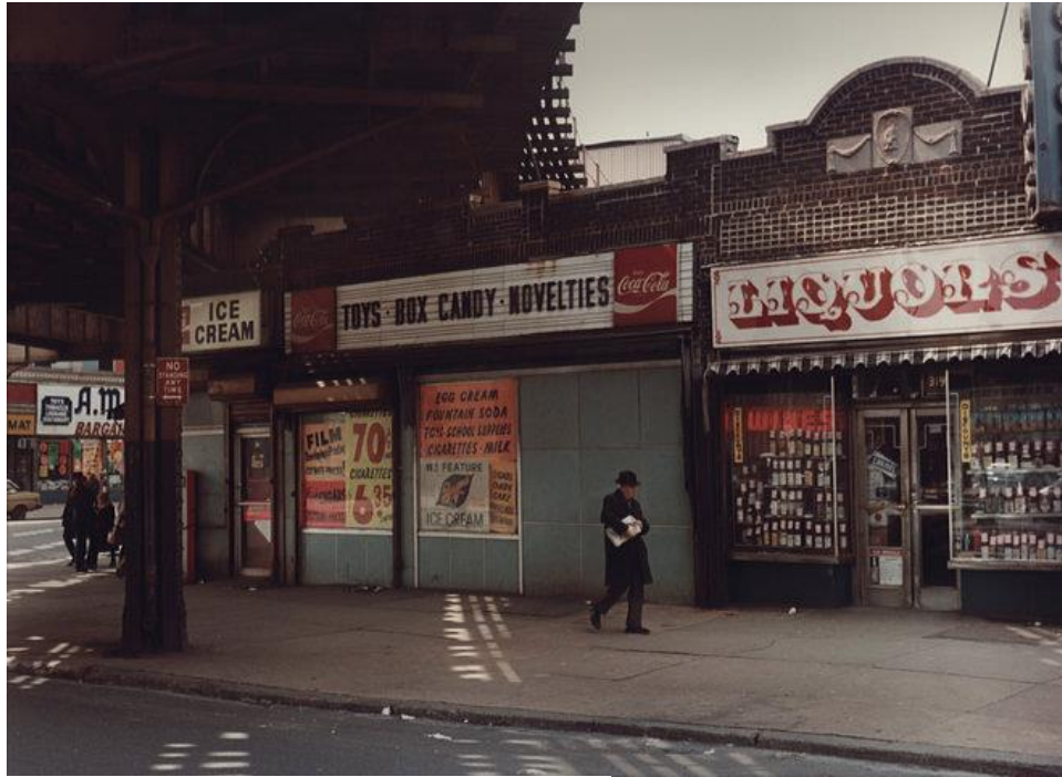
[Brighton Beach Under El, Brooklyn, NY, 1979.]