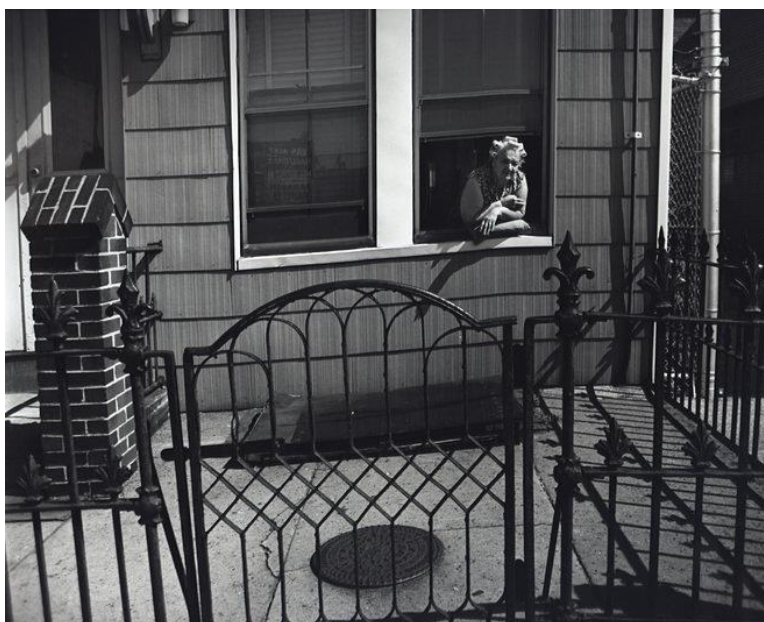
[Brighton Beach, Brooklyn, New York, 1976.]