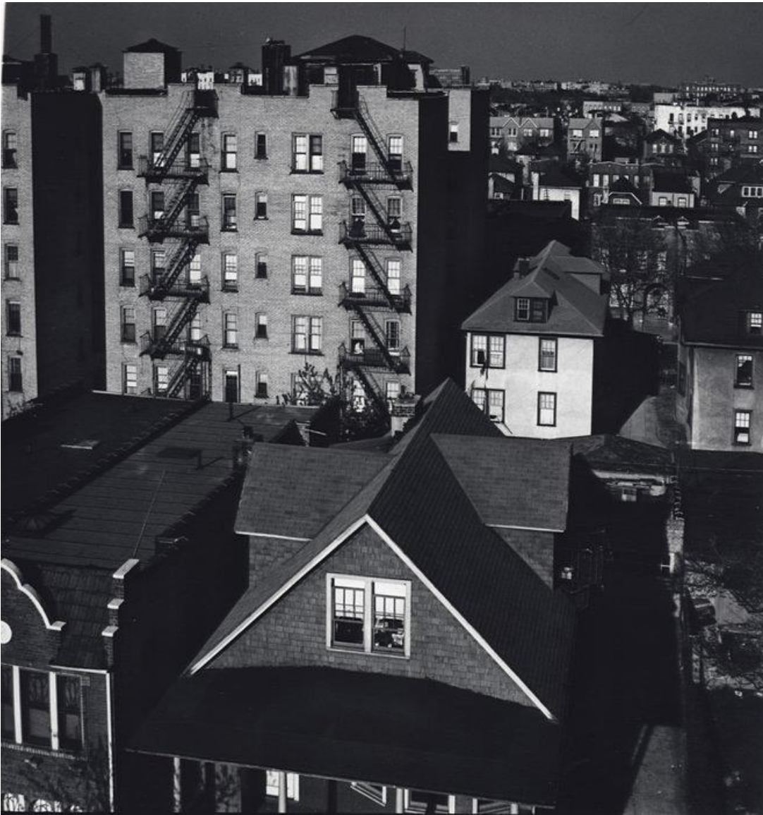
[Brooklyn, New York, 1947.]

demographic shift. "Renowned for capturing the city's poetic and fleeting moments with a social-minded sensibility," Liebling's body of work is vast, spanning boroughs, decades, and photographic styles— above all , "trying to find the meaning behind everyday New Yorkers." Inspirational to documentary-makers everywhere, he was "so authentic, in a way that a lot of us had never experienced," said Ken Burns . "You wanted to be like him. You wanted to tell the truth."