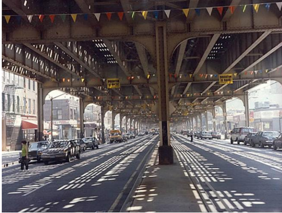
[Brighton Under El, Brighton Beach, Brooklyn, New York, 1985.]