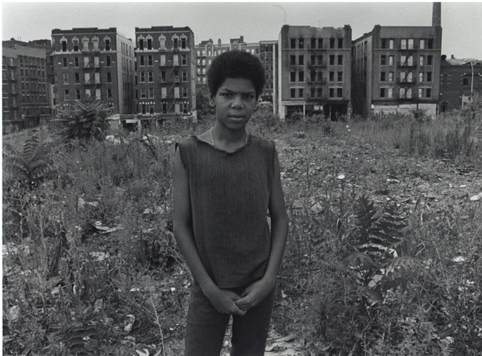
[Charlotte Street, South Bronx, New York City, 1977.]