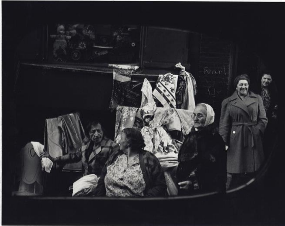
[East Side, New York City, 1947.]