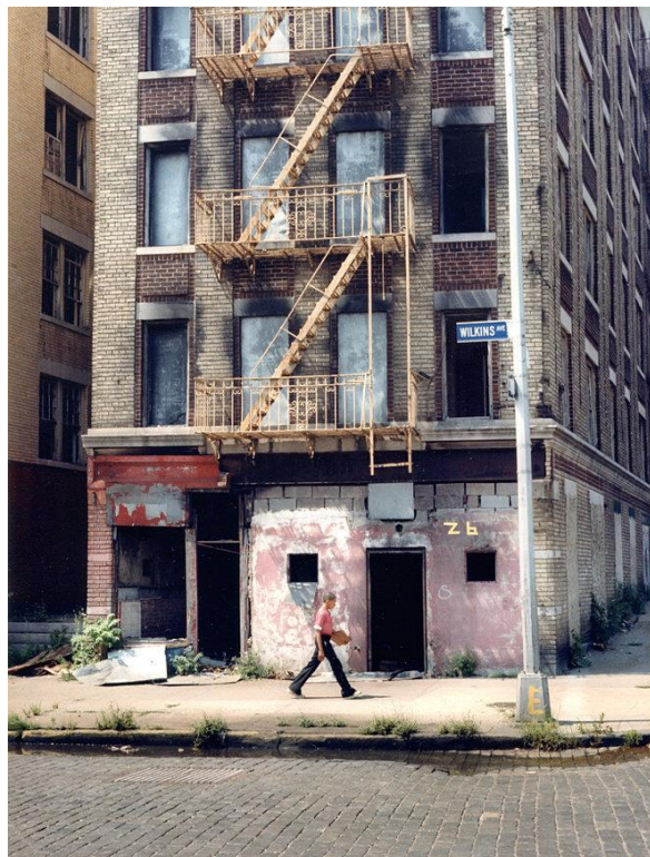
[Wilkins Avenue, South Bronx, New York City, 1979.]