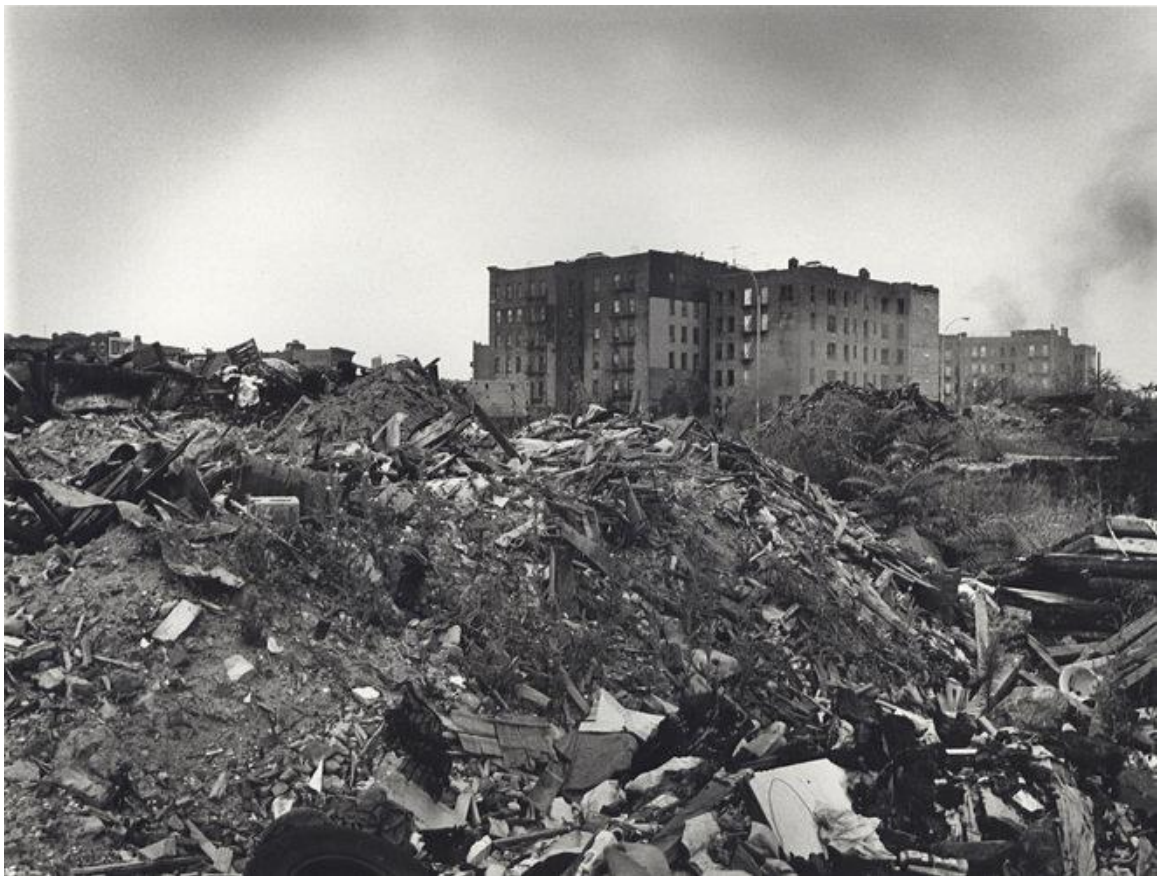
[South Bronx, New York City, 1977.]

Fifty of his photos are on display in " Jerome Liebling: Brooklyn and Other Boroughs , April 24th – June 6th 2015 " at the Steven Kasher Gallery until June 6. Go forth.