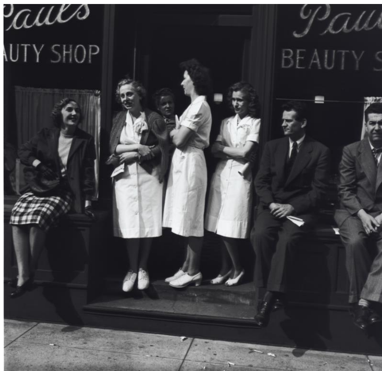
Beauty Shop Brooklyn, New York City, 1947