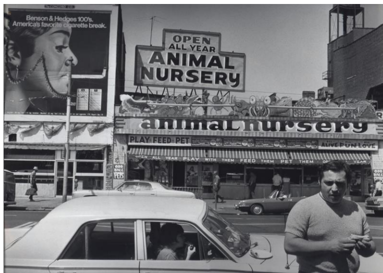
Coney Island New York City, 1973