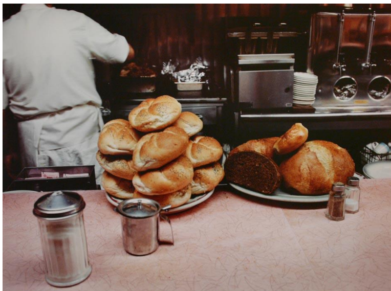
Lunch Counter Brighton Beach, Brooklyn, NY, 1981