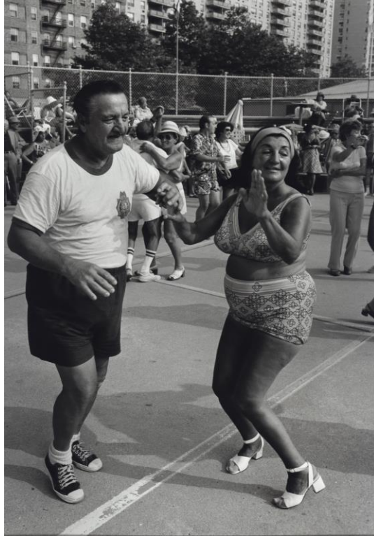
Brighton Beach Brooklyn, New York, 1976