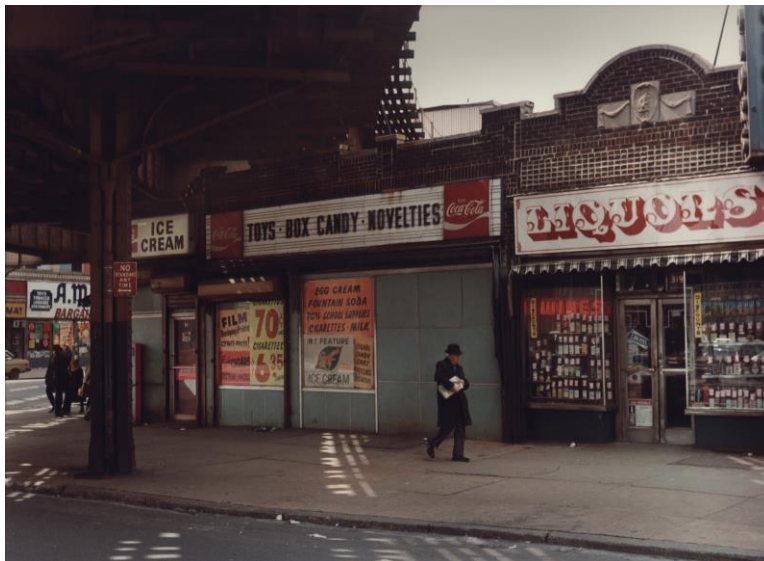
Brighton Beach Under El Brooklyn, NY, 1979