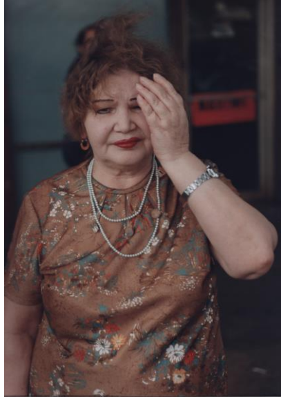
Woman and Hand Brighton Beach, Brooklyn, NY, 1984