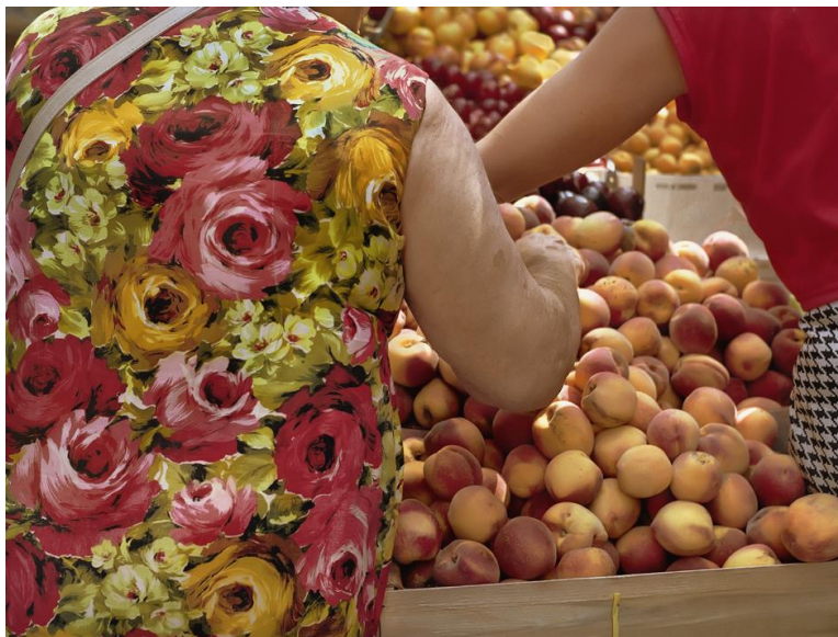
Women Buying Peaches Brighton Beach, Brooklyn, 1995