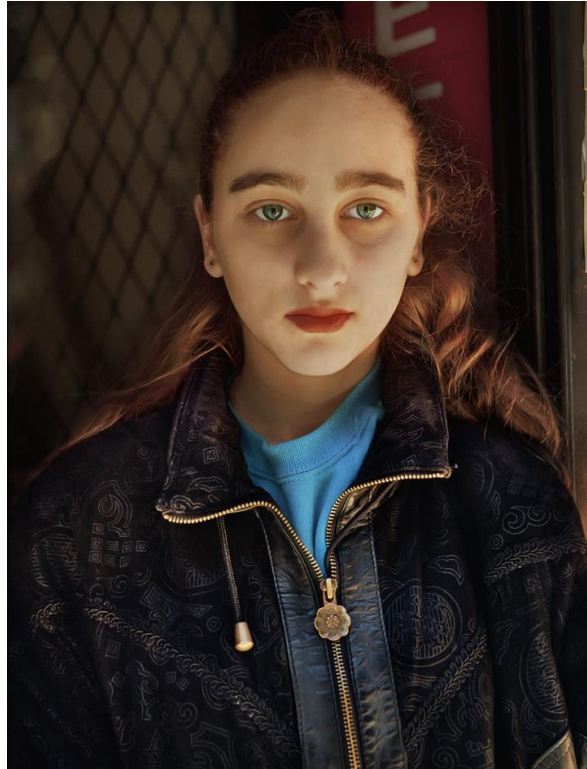
Young Russian Immigrant Brighton Beach, Brooklyn, NY, 1996