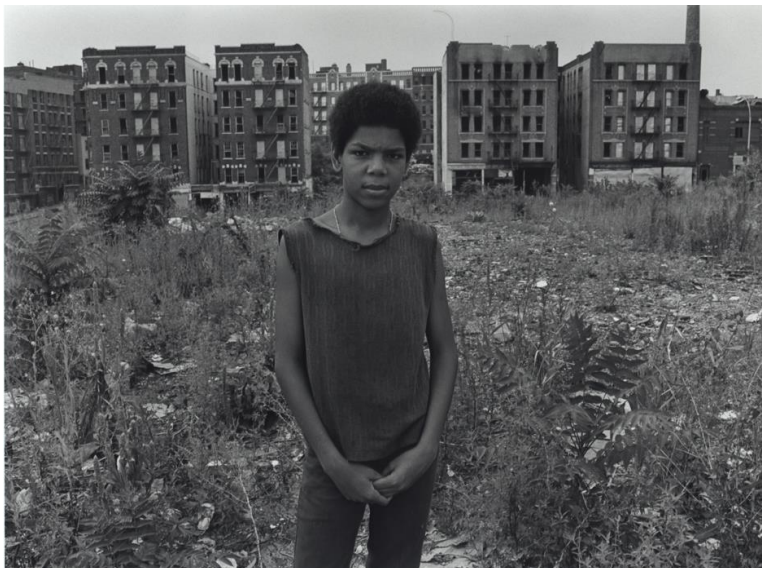
Charlotte Street South Bronx, New York City, 1977