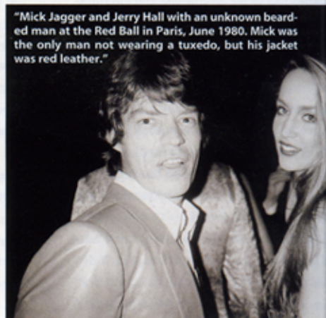
"Mick Jagger and Jerry Hall with an unknown bearded man at the Red Ball in Paris, June 1980. Mick was the only man not wearing a tuxedo, but his jacket was red leather."