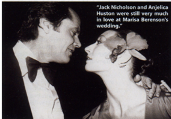
"Jack Nicholson and Anjelica Huston were still very much in love at Marisa Berenson's wedding."

The intention was to have the pictures give you the feeling of being at the party. That's why some are at skewed angles, or there's half a head or a hand in the corner of the frame. They're not the kind of shots you get today with people standing there with their drink smiling into the camera. It was before the paparazzi industry changed the nature of those pictures, when they were still spontaneous and you could catch a moment. What I was doing was much more candid than you would see today."—Bob Colacello