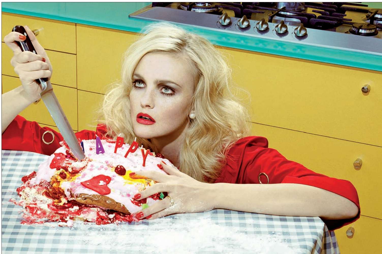
Above: Home Works – Vogue Italia , 2008.