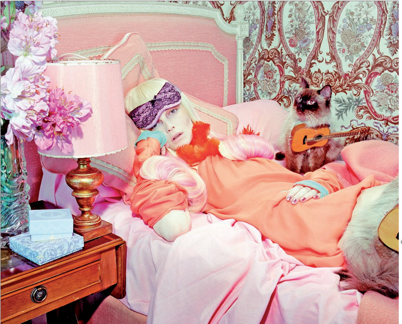
Above: Cat Story – Vogue Italia , 2008, with preparatory sketch (right).