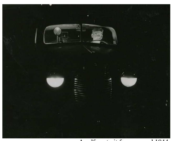
A self-portrait from around 1944.

He was just in time to convert the emerging genre of tabloid photojournalism, with its surfeit of murder and mayhem, into an earthy and memorable art form. Within a very few years he was a kind local personality and folk hero known for reaching crime scenes ahead of the competition, if not the police. He called himself Weegee the Famous.