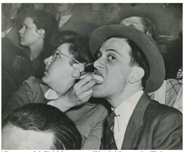
"Resourceful Girl Manages to Watch Man on the Flying Trapeze and Feed Hot Dog to Escort at Same Time" (1943).

a driven hustler in pursuit of humankind in extremis and as the creator of a tough-guy, crime-fighter persona, as evidenced by examples of his many self-portraits that dominate the show's first gallery. (One shows him flopped down on his stomach on the floor of a paddy wagon, camera cocked, like a hunter, waiting for the first arrest of the night.)