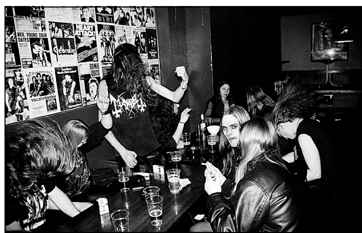
HANGOUT: Elm Street Pub portrays headbanging rockers in their natural habitat in Oslo, Norway, in 2003.