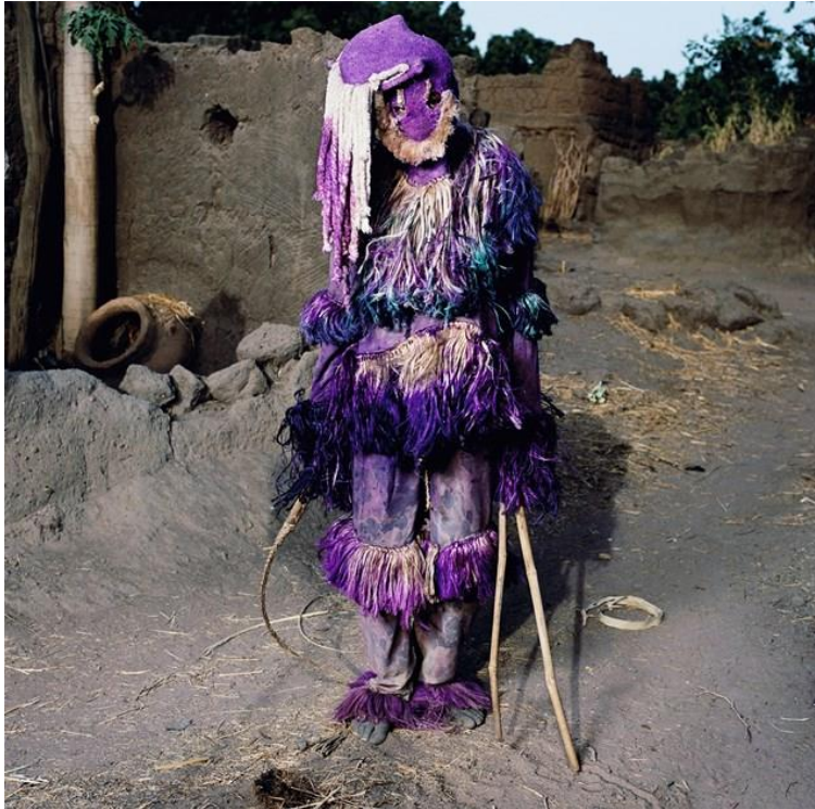
Panther Masquerade, Samaga Village, Burkina Faso, 2006